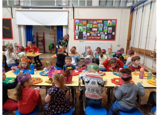
The children enjoyed their Christmas dinner on Monday, with festive music, crackers from the PTA and even a bit of staff dancing thrown in!